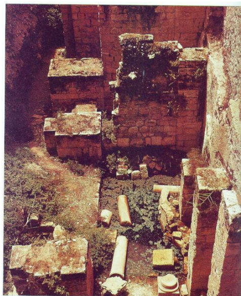
The Pool of Bethesda lies within the present walls of the Old City of Jerusalem, and is viewed here below the remains of a Byzantine church built over the pool.