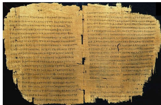
Historical writings, eg. The Histories of Josephus

Examples of evidence that shows the Bible is true: