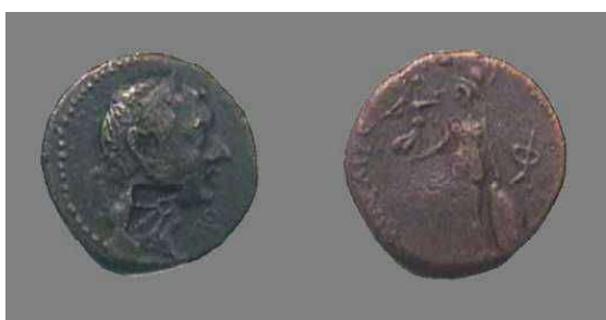
Ancient artifacts, like these coins.

Biblical places verified by archaeology: